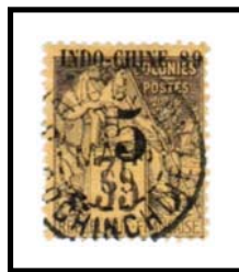
SAIGON CAL COCHINCHINE