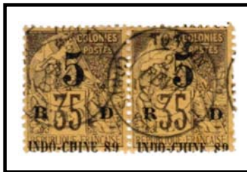
TONKIN CORPS EXPEDITRE (shifted overprint)