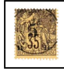
HANOI-CONCES ON TONKIN