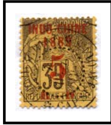
CAP St. JACQUES COCHINCHINE