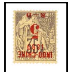
Facsimile of the inverted overprint in red.