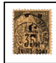
Facsimile of the inverted large "1889" overprint in black.