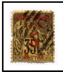
B62 (HONG KONG)