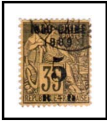
Facsimile of the large "1889" overprint in black.