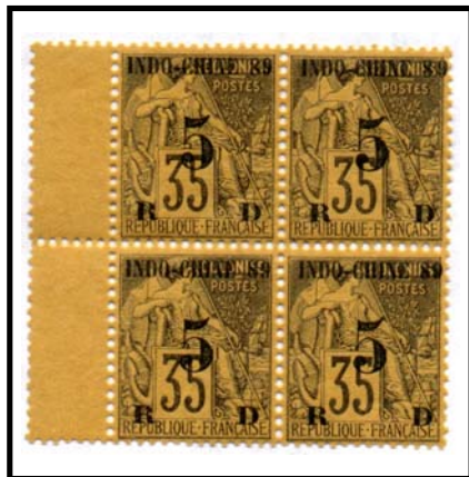
widely spaced "8 9" (upper right)