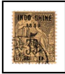
Facsimile of the small "1889" overprint in black.