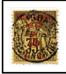
SAIGON CAL COCHINCHINE